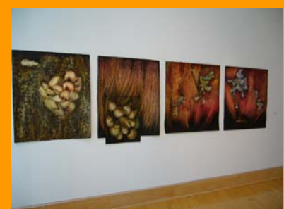
Heloisa Pomret "Witness of the Unconscious"

The show is featured in the Student Activities Center Gallery and will be on exhibit until November 2, 2007. The gallery is open Tuesday-Friday, 11am-5pm.