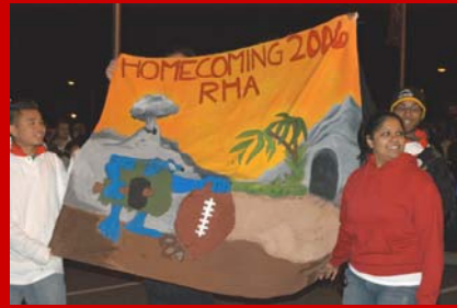
Resident Hall Association