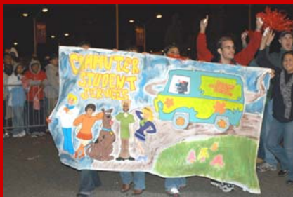
Commuter Student Association

Wolfstock...A Homecoming Tradition is scheduled to kick off on Monday, October 15 th . We have some very exciting events planned for homecoming this year as we celebrating 50 years of excellence at Stony Brook University. Student Activities and the Alumni Office have been working on the plans for this annual tradition for the past few months. Come out on October 20 th as the Seawolves take on the Maine Black Bears at 3pm in LaValle stadium. There will be giveaways, food, music and so much more for students, faculty, staff, community and families to do.