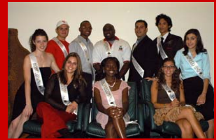
2006 Homecoming Court

Go to http://ws.cc.stonybrook.edu/communicatio/Homecoming/ for more information about Wolfstock...A Homecoming Tradition. We look forward to seeing you at all of the events.