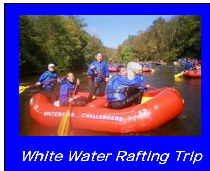
White Water Rafting Trip

ers soaked up some rays. After a little R & R the group set back to much calmer seas and the trip back home was thankfully much easier. Many of the kayakers were first timers with the exception of few. The students had a great time and