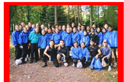
Group Photo Whitewater Rafting

The weather bureau is predicting plenty of snow for this upcoming winter and we welcome it as we plan for winter outdoor recreational activities. The annual Cata-mount Ski Trip is planned for February 10, 2008. Plans are also in the works for a Cross Country Ski and Snow Shoe Trip. Keep your fingers crossed for plenty of snow. To register for any winter trips contact Campus Recreation at 632-7168.