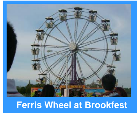
Ferris Wheel at Brookfest

For more information on how to become a part of week-