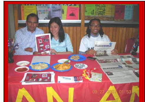
Editors of the AA Journal, AA Zine & Blackworld