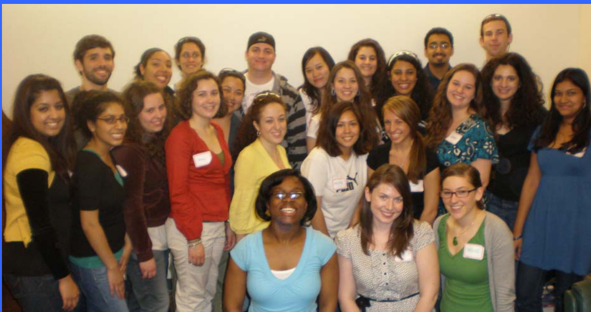
2008-09 Commuter Student Assistants

Look for the CA's next year during their office hours in the Commuter Commons (SAC 144), where they will be set up to answer your commuting questions! You can also always find them at CSS events throughout the year. If you know someone who will be commuting to campus for the first time and might like to be paired with someone who can ease their transition and show them the ropes, please let them know they can request a CA at by clicking on the "Commuter Assistant Program" link at http://studentaffairs.stonybrook.edu/css .