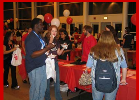
Scooping Out Success