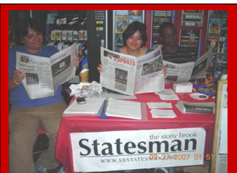
Editors of Statesman

We want to welcome all the new and returning students. The office has some exciting activities, programs and workshops planned to help expand your media, news, and communications skills in the fast changing multimedia world of today.