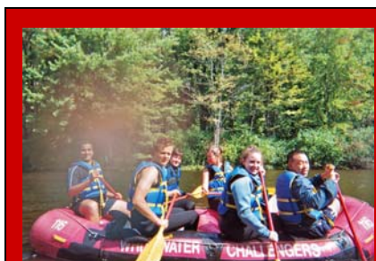
Whitewater Rafting Trip

In addition to the sport opportunities that Sport Clubs provides, the success of the Sport Club program depends heavily upon the student leaders of each individual Sport Club. These student leaders must have the initiative and drive to handle administrative decisions regarding their club, as well as motivate club members to take part in various activities.