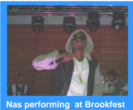
Nas performing at Brookfest

The Department of Student Activities is hoping to assist in debunking the myth that there is nothing to do. The University has seen that there is a need to centralize Weekend Life and improve on its publicity and programming as well as other aspects, hence the origin of Red Hot After Hours. Since the inception of Red Hot After Hours in October 2006 the Weekend Life programming and participation has increased by fifteen percent!